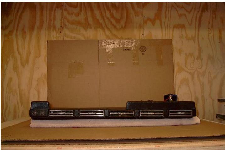
LHD Evaporator with Top Finish Panels Installed