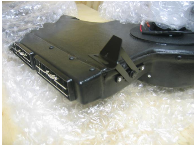
Custom Evaporator Bracket installed (1 Side)